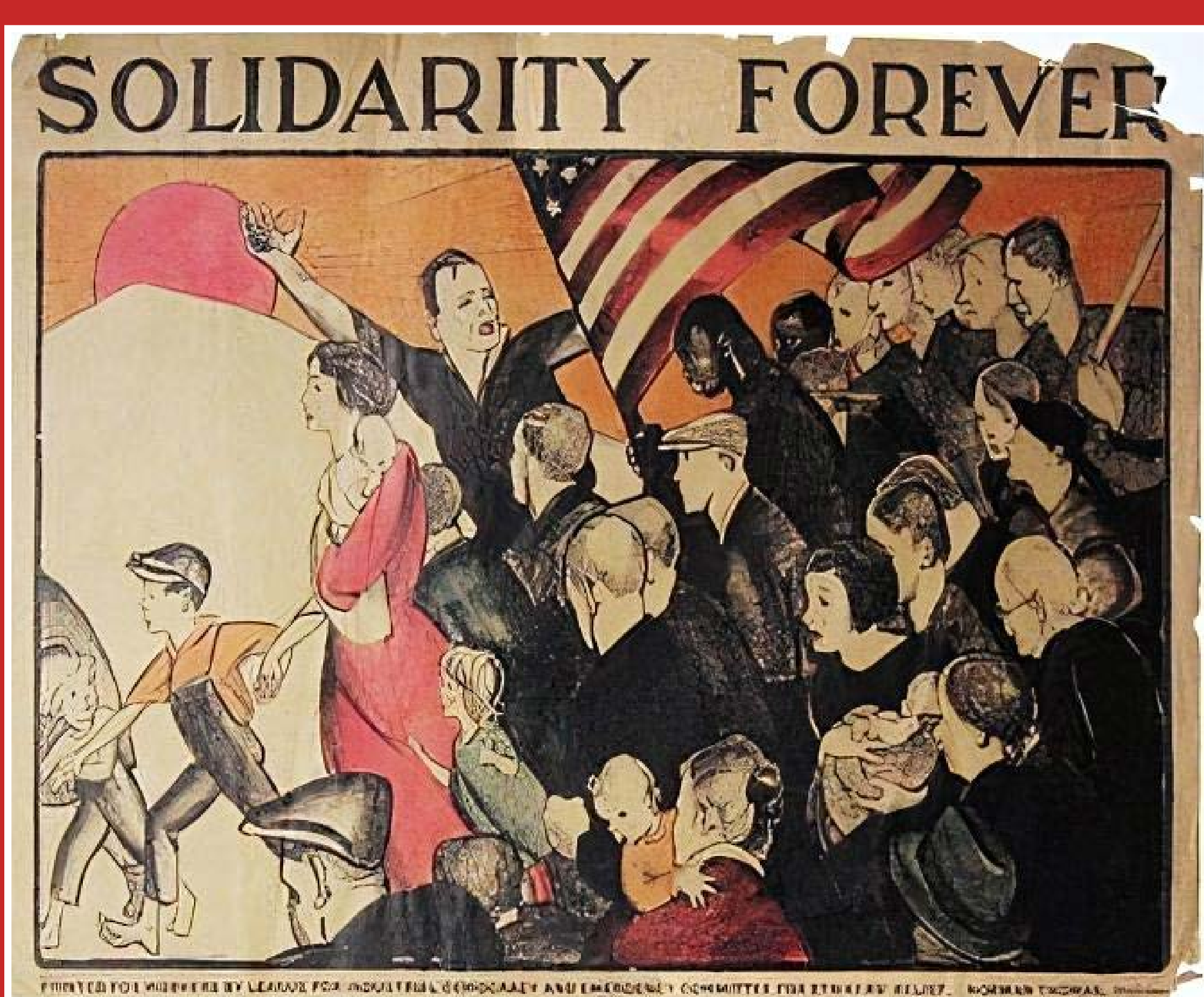
Photo by Judy Seidman of League for Industrial Democracy / Poster art by Anita Willcox / CC BY 3.0

Featuring the song title "Solidarity Forever," a trade union anthem written in 1915 by Ralph Chaplin promoting the power of solidarity amongst workers, this poster for the League for Industrial Democracy as designed by Anita Willcox during the Great Depression depicts solidarity with the struggles of workers in America.